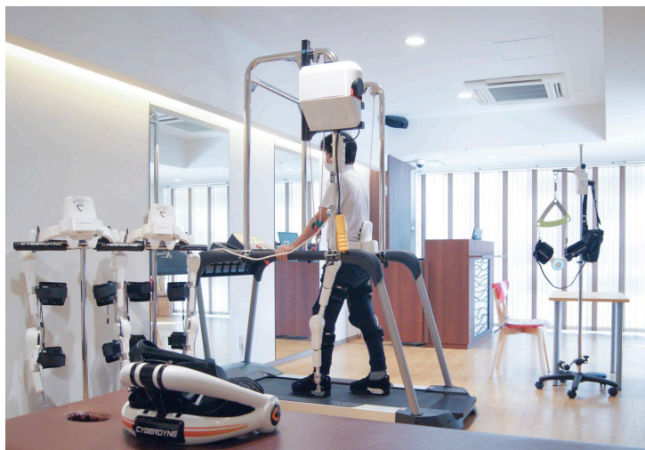
Image of Robocare Center

For the Neuro HALFIT program offered in the related Robocare Centers, some private insurance contracts *2 and shareholder benefits *3 can be used. Upon using the aforementioned scheme, there are certain conditions, which would be applied, so please check the appendix for the details.