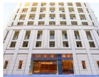
Hotel Meriken Port Kobe Motomachi