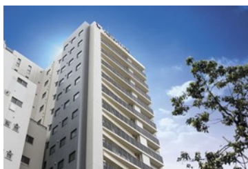
Hotel Wing International Select Ueno/Okachimachi (Owned by MIRAI)