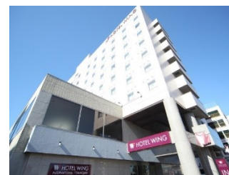
Hotel Wing International Tomakomai

*The number of locations is as of October 2020.