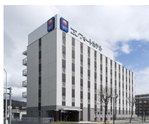
Comfort Hotel Kitakami (Owned by MIRAI)