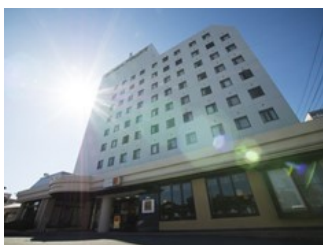
Ise City Hotel Annex (Owned by MIRAI)