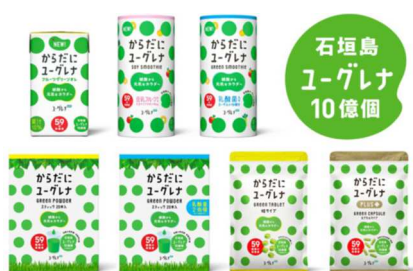
Euglena food "Euglena for the body"

Euglena Co. is a venture company originating from the University of Tokyo that sells health foods and cosmetics using the microalgae Euglena , and was the first company in the world to succeed in the outdoor mass cultivation of Euglena for food usage. It also conducts research and development on biofuels and feed. Since listing on the First Section of the Tokyo Stock Exchange in 2014, it has achieved rapid growth centered on the mail-order business for health foods and cosmetics, while also promoting businesses in the sustainability area, such as biofuel R&D and demonstration manufacturing and support for Bangladesh. In August 2020, the 15th anniversary of the Company's founding, it revamped the Corporate Identity (CI) and established "Sustainability First" as the Euglena Philosophy. For more information, see https://www.euglena.jp/ website.