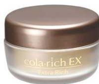
All-in-one cosmetics "Cola-Rich"