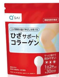
Food with functional claims "Knee Support Collagen"