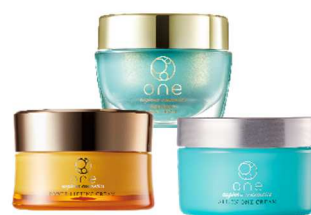
Euglena cosmetics "one"