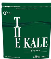
Kale Aojiru juice using Japanese grown kale "The Kale"