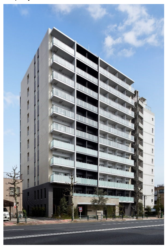
Property 1: Park Axis Kikukawa Station Gate

Photo of the properties to be acquired and map of the area