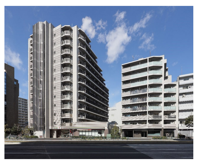
(Left: Park Axis Kiba Canal West Right: Park Axis Kiba Canal East)

Property 2: Park Axis Kiba Canal West Property 3: Park Axis Kiba Canal East