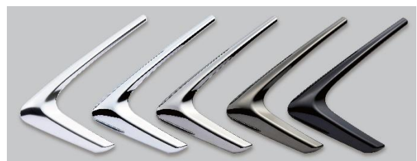
Main plating variations

[From left: Satin, neutral, dark, lacquer black, new lacquer black]