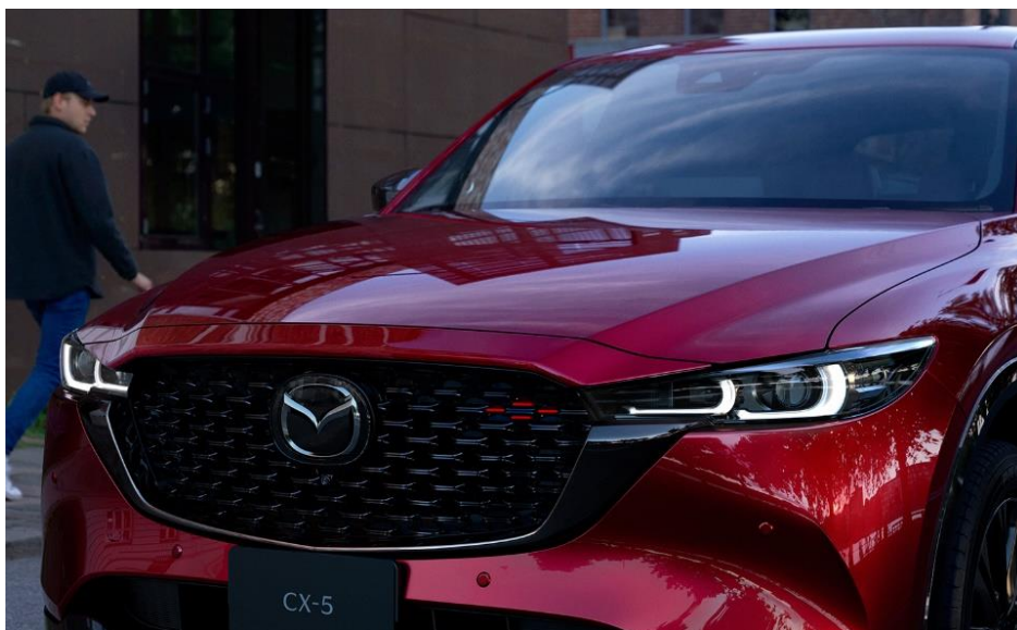
Front end of the Mazda CX-5 (the area plated with the new lacquer black is at the bottom of the front grille) 2

1 The mixture of special materials gives the plating the opposing feels blackness and luster.