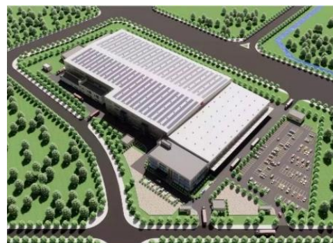
New plant (rendering)