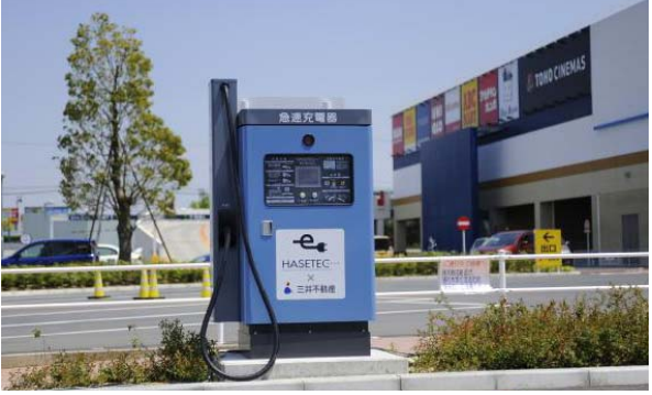
Mitsui Shopping Park LaLaport Iwata