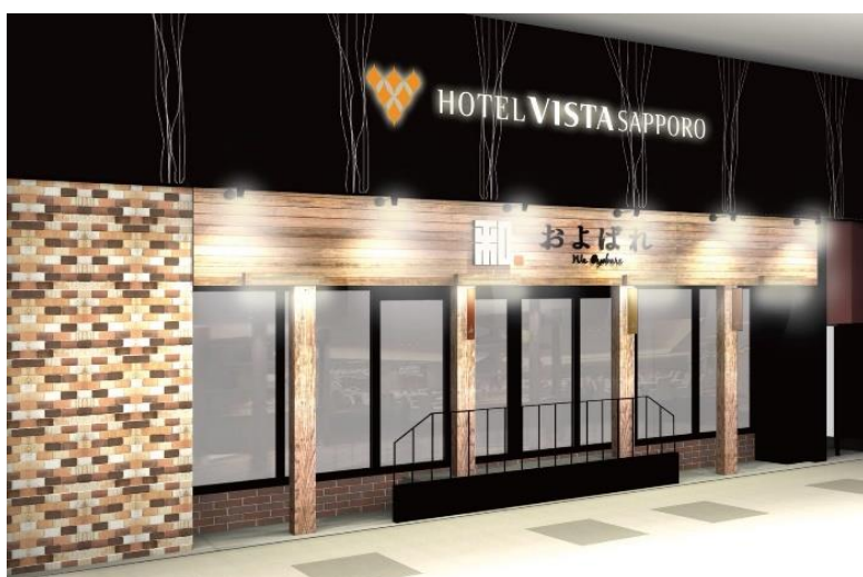
Wa Oyobare - Japanese cuisine restaurant facing Tanukikoji Shopping Arcade