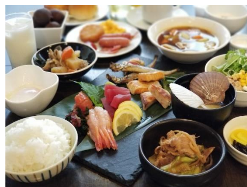
Breakfast (example) at Wa Oyobare