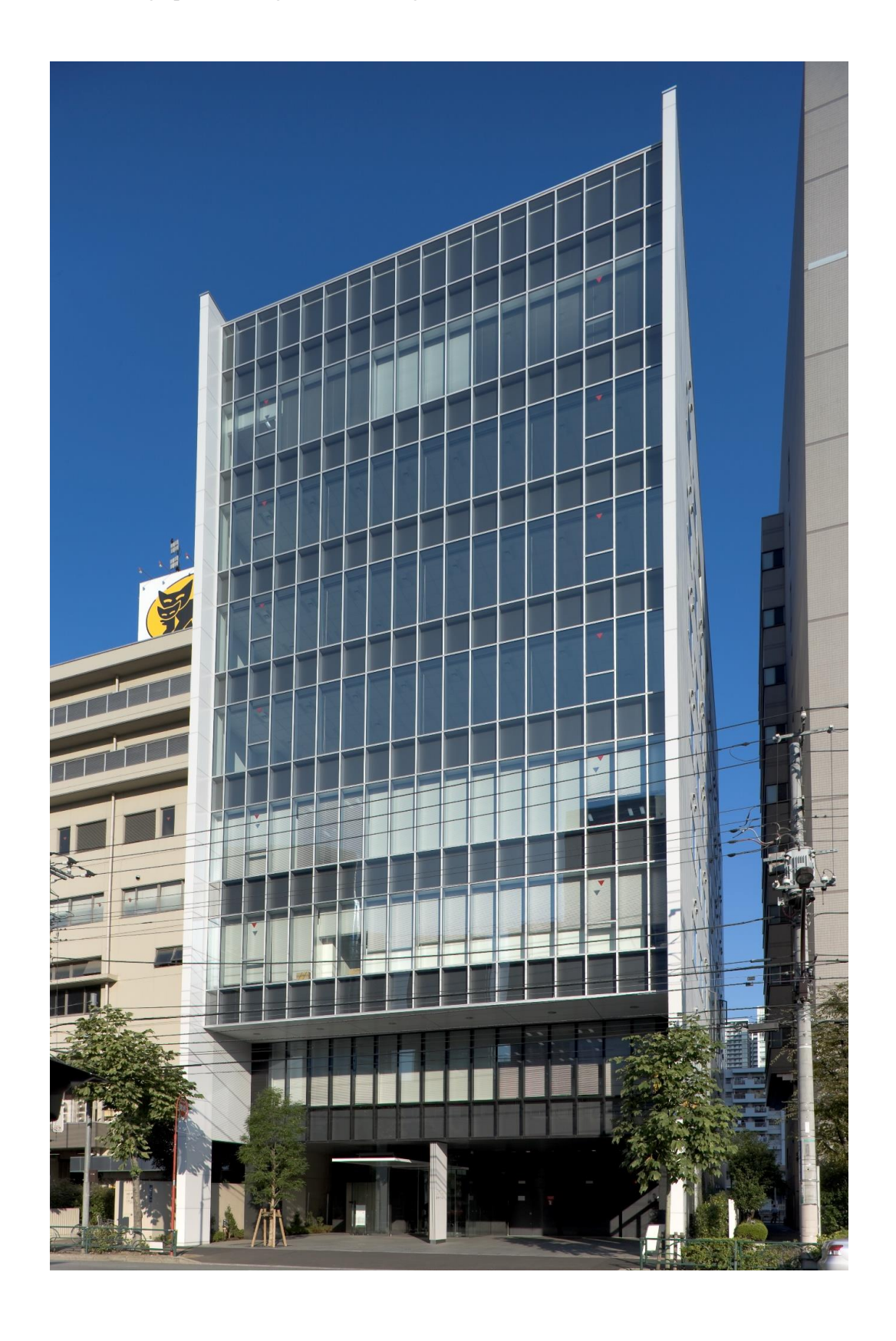
[Reference 1] Photograph of Shinagawa Canal Bldg.