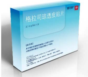
Sancuso® Chinese Product Package