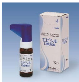
episil® Japanese Product