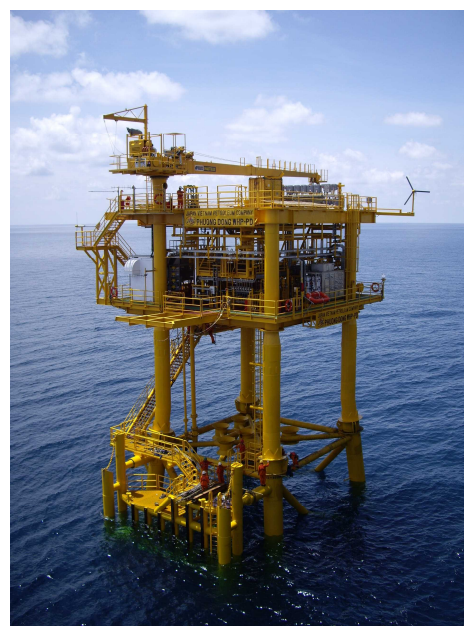
Phuong Dong Platform